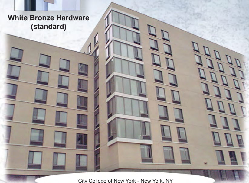
City College of New York - New York, NY

Visit us online: www.keystone-industries.com