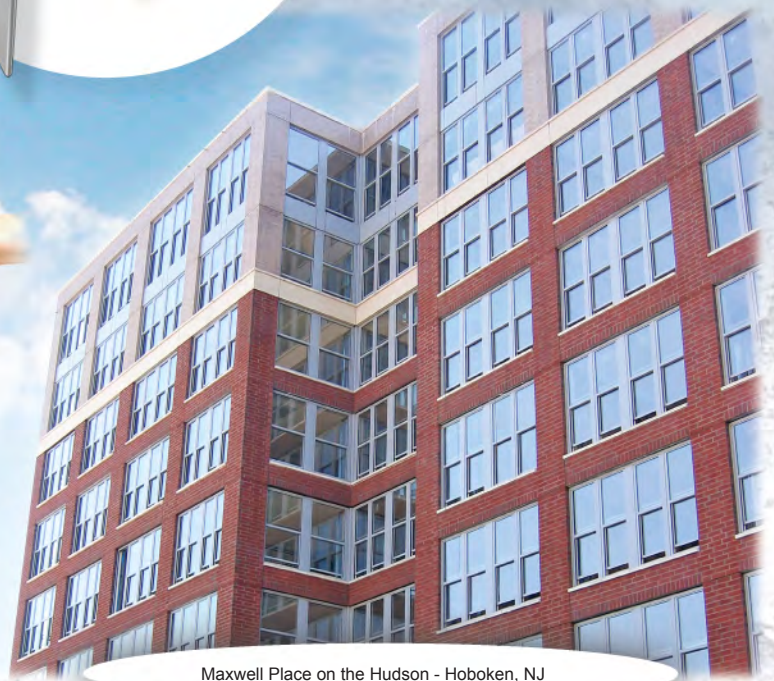
Maxwell Place on the Hudson - Hoboken, NJ

Visit us online: www.keystone-industries.com